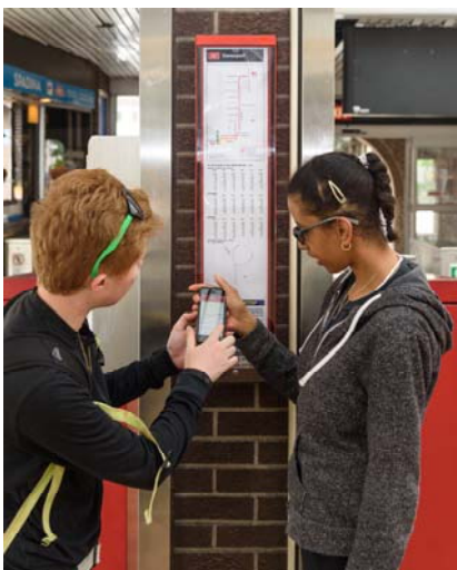
Coordinator and Michelle comparing the digital and printed TTC schedule.

After the student successfully finishes the in-class curriculum, they proceed to the personalized route training. Participants can choose what route they want to learn – for example, getting to work. The route training consists of 35 hours of 1-on-1 training with a coordinator. During the 35 hours, the coordinators use a shadow model. First the coordinators go along with the individual side by side on their route. Slowly, they pull back as the individual gets comfortable, starting with sitting a few seats back and so on. Once they have taken 3 trips without any errors, they move on to the final step, which is taking the TTC independently and meeting their coordinator at the destination.