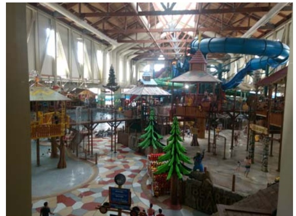
The indoor waterpark at Great Wolf Lodge