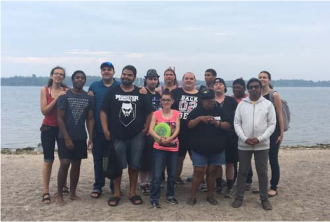
sprOUT Toronto Group at Cherry Beach: August, 2018