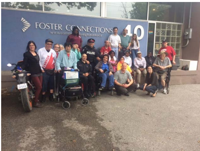
The Self Advocates Council begins work with the Toronto Police