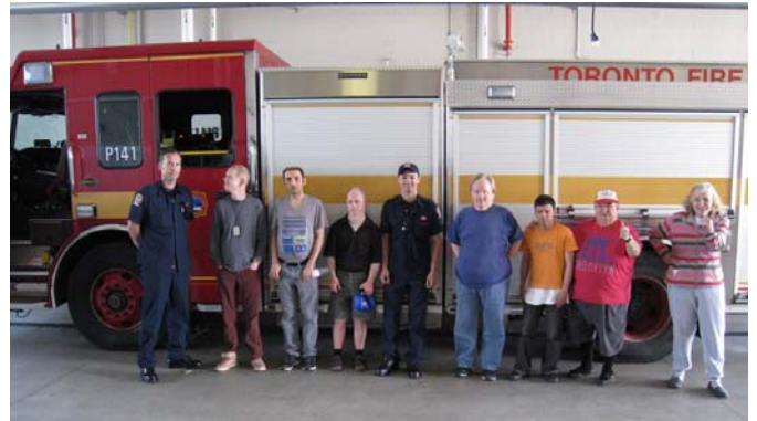
North York SWACA visited a fire station this summer! Here they are posing in front of a Fire Truck!