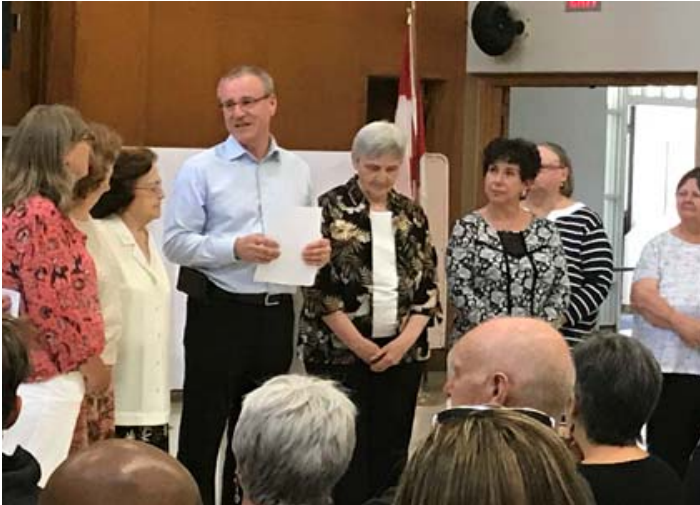
Etobicoke/York Council and Borys Wrzesnewskyj - Liberal MP Etobicoke Centre

On a beautiful Sunday afternoon on June 10, 2018, Community Living Toronto's Etobicoke/York Council were honoured and celebrated for Exceptional Volunteers with an Organization by Borys Wrzesnewskyj, Liberal MP for Etobicoke Centre.