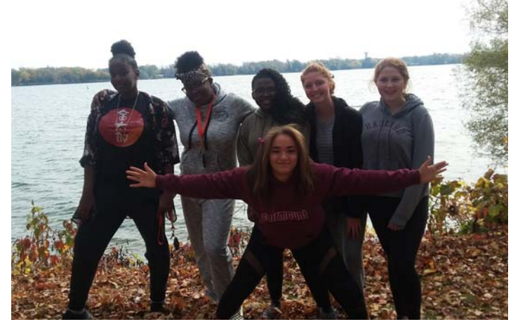
Community Living Toronto Council Sponsored Students at 2017's Re:Action4Inclusion Conference