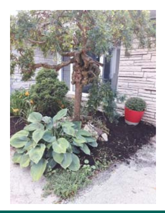
A little piece of paradise planted at Guildcrest Residence

Guildcrest Residence was gifted a Volunteer Day by Home Depot. The store and volunteers were extremely generous in the donation of their time, skills and product. They beautified our gardens in the front of the home with low maintenance perennials and brightly colored planters. We now have a large gazebo out on the back deck that will protect the ladies from the direct sun, making the use of our deck more available. The plan was to repair the back fencing that was damaged in the big windstorm but the volunteers found the damage too great so spent even more money and time replacing the majority of it! They increased the beauty and safety of the home. For that we are very grateful. Our appreciation goes out to these wonderful, generous and friendly employees of our local HOME DEPOT!