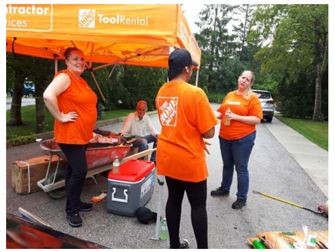
Home Depot employees gearing for a hard days work at Guildcrest Residence

Guildcrest Residence was gifted a Volunteer Day by Home Depot. The store and volunteers were extremely generous in the donation of their time, skills and product. They beautified our gardens in the front of the home with low maintenance perennials and brightly colored planters. We now have a large gazebo out on the back deck that will protect the ladies from the direct sun, making the use of our deck more available. The plan was to repair the back fencing that was damaged in the big windstorm but the volunteers found the damage too great so spent even more money and time replacing the majority of it! They increased the beauty and safety of the home. For that we are very grateful. Our appreciation goes out to these wonderful, generous and friendly employees of our local HOME DEPOT!