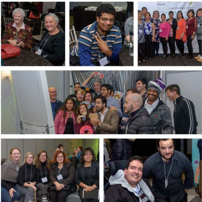
A collage of photos from the staff appreciation event.

On Tuesday November 20th, we held our staff appreciation event at Parkview Manor. Everyone was in jolly moods mingling and networking with coworkers that they may not be able to chat with on the day to day. We have the best and most dedicated staff!