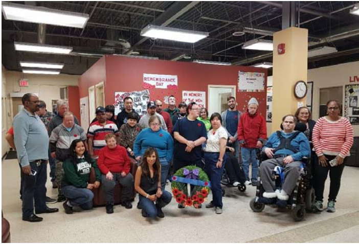
J.S. Manson participants and staff during their Remembrance Day Ceremony, November 2018

Remembrance Day holds an important place in the hearts of Community Living Toronto's Jessie S. Manson participants. They have great appreciation and gratitude to the men and women who sacrificed and dedicated their lives to keep Canada safe. Every year, among poppies and a commemorative wreath, the Manson community honors the memory of the women and men who served our country in war and peace.