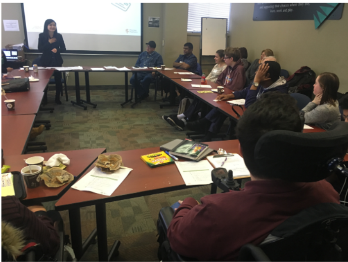
Money Matters workshop at 20 Spadina

On Wednesday November 21st, we had a Money Matters work shop at our 20 Spadina location. Money Matters was created by ABC Life Literacy Canada with support from Money Matters founding sponsor TD Bank Group, as part of their corporate citizenship platform.