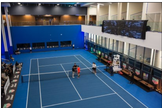
The tennis court at Play It Forward

190 guests attended and $150,000 was raised! Thank you to our generous sponsors, donors and ticket purchasers, the creative energy of Prestantia Management Group and our tennis stars, Denis Shapovalov, Frank Dancevic, and Vasek Pospisil!