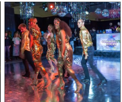
The Hit & Run Dancer put on an amazing show