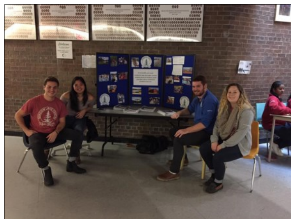
Shadow Lake Centre staff at the Christmas Market