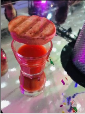
Tomato soup with grilled cheese.

Seventh Heaven also made sure that hors d'oeuvres were circulating throughout the event space, my personal favourite was the tomato soup with grilled cheese, which were both mini! So cute, and comforting, all in one bite (and sip)!