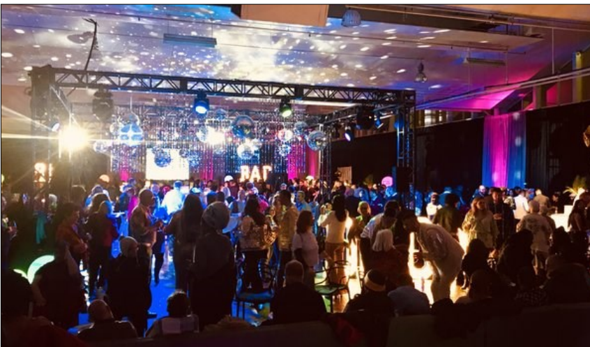
Everyone dancing at Community Rocks!