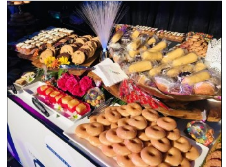
A view of the dessert table.

After the savory deliciousness, the dancing, and the live rock concert, guests were invited back into the main event space and treated to amazing desserts. There were dessert stations all along the periphery, with every kind of candy and baked good you could desire, but I couldn't get over the ice cream truck that was brought inside for sweet and creamy soft-serve! Chocolate and vanilla twist is my favourite, and goes really well with ABBA. The glazed donuts available at the dessert stations were also pretty fantastic, and take second place for my indulgent treat of the night.